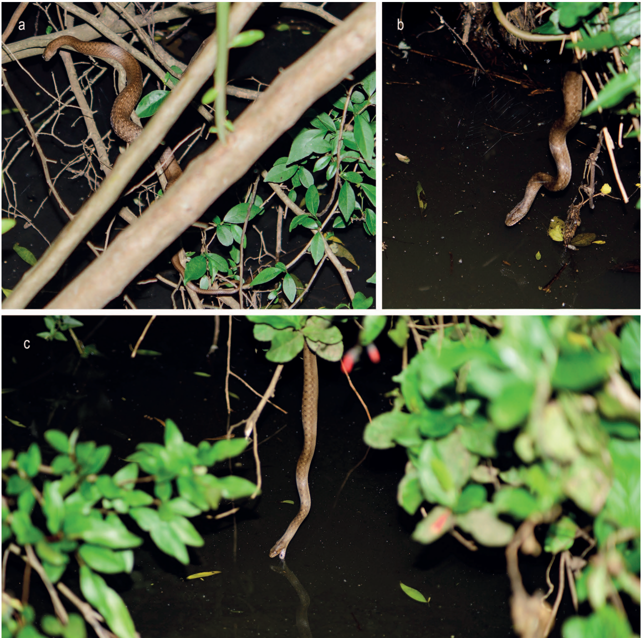
Figure 2. Thamnodynastes strigatus ambush behavior stages: selection phase (a); establishment phase (b); waiting phase (c).

gan ingesting the fish in an anteroposterior direction. After the fish ingestion, which lasted about five minutes, the snake returned to its ambush position. After being ingested, the fish continued to move inside the snake for some seconds. The second predation event also occurred in November, at 8:30 p.m.. When found, the snake was already in an ambush position, beginning at 7:49 p.m.. The way of capture was identical to that of the first record, with the difference that this time the fish ( H.luetkenii ) was caught by its median dorsal body part. After the capture, the snake remained perched on the vegetation, taking about 15 minutes to position the fish in anteroposterior direc-