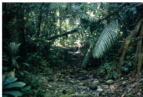
Fig. 2. Habitat of Pristimantis minutulus at Panguana, Peru.

(Fig. 3). All our specimens have a W-shaped, dark brown or blackish mark in the scapular region and large blotches in the sacral region extending to vent. Among our specimens, we also discovered previously unknown life colouration variation. They may have a thin to broad whitish to cream middorsal stripe