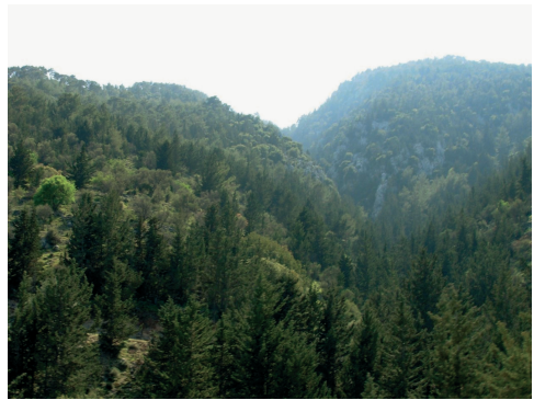
Fig. 4. Biotope of Selvili Tepe (Kyrenia Mountain Range), Lapethos-Kyrenia, N. Cyprus, 801 -938 m a.s.l.

substrate on limestone, enriched by organic wastes derived from the leaves of cypresses and terebinth trees. In the same area the following reptiles were also collected: Ophisops elegans schlueteri , Ablepharus budaki budaki , Trachylepis vittata , Macrovipera lebetina lebetina , Malpolon insignitus . At some distance, frogs of the Pelophylax ridibundus complex were seen in spring waters and man-made pools. According to our observations, Eirenis