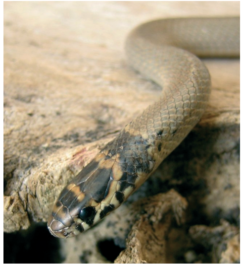
Fig. 3. Eirenis levantinus (ZDEU 199/2007, Nr.2) male, from Selvili Tepe (=Kornos), N. Cyprus.

prus), which was also observed by one of us (GÖÇMEN, in March 1997). This specimen was found in the westernmost part of the Kyrenia mountain range, the northern one of the two mountain ridges in Cyprus. Unfortunately, this specimen could not be collected. It escaped into a compact blackberry shrub within a rocky area (ca. 440 m a.s.l.), where rainwater was flowing. Since then, the same locality has been visited repeatedly, however without any success.