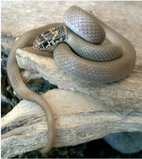
Fig. 2. Eirenis levantinus (ZDEU 199/2007, Nr.1). female, from Selvili Tepe (=Kornos), N. Cyprus.