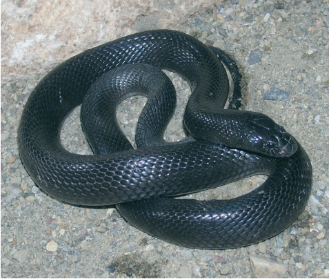
Fig. 2. Walterinnesia morgani (ZDEU 222/2007) from near Çörtten village (Kilis/Gaziantep prov.).

comprised a heavily eroded stony slope with a sparse cover of small bushes. Sympatric amphibians and reptiles included Bufo variabilis , Stenodactylus grandiceps , Apathya cappadocica , Eumeces schneiderii , and Trachylepis aurata . When the individual was caught, it vomited an adult semi-digested Bufo variabilis . ZINNER (1971) and DISI et al. (1988) stressed the importance of this bufonid as prey for Walterinnesia in Israel and Jordan and even supposed that Walterinnesia populations increase due to the expansion of agricultural settlements in desert areas which lead to an increase of Bufo populations.