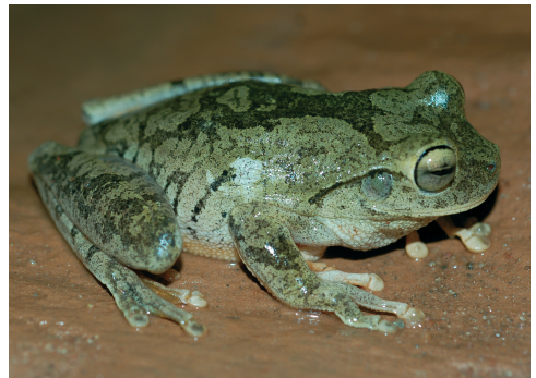
Fig. 3. The recorded male of Hypsiboas crepitans in life. Santana do Riacho, Serra do Cipó, Minas Gerais State, Brazil.

dominant frequency (350 Hz), and the pulse number (3-11) of calls from Colombia are lower than ours. In the Panamanian populations the call is trilled, shorter (200 ms), and presents a lower rate of emission (20/min.) compared to ours. Considering the extensive geographical distribution and the great inter-population variability in color, body size, advertisement call, and breeding biology, several different species may be included under the name H. crepitans (KLUGE 1979, DUELLMAN 2001, LYNCH & SUÁREZ-MAYOR-