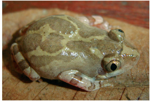
Fig. 6. Kassina fusca from the Nialama Forest area. This is a relatively common West African savanna species, herein recorded for the first time in Guinea.

The majority of species (14 species, 56%) has a distribution range exceeding West Af-