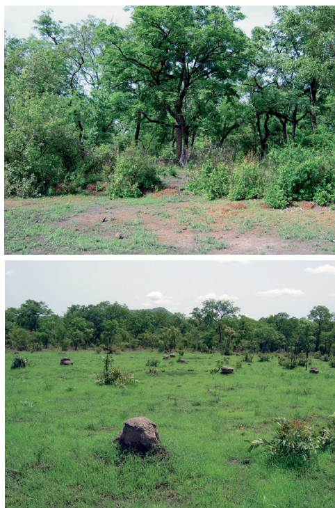
Fig. 2. Two typical aspects of the landscape in the Nialama Forest area; the open dry forest and the “bowal” savanna.

crosses the river. There is ongoing construction of a tourist camp, while no measures have been taken to cater for waste or sanitary infrastructure. The forest around the Saala Waterfalls still harbours a big population of chimpanzees (E.O. TOUNKARA, pers. comm.) and an ornithological survey revealed a high diversity of birds (N. KEITA & R. DEMEY, pers. comm.).