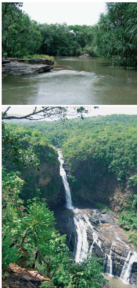
Fig. 3. Saala River and Saala Waterfall, the habitat of an undescribed Conraua species (see Fig. 5).

The second study site, the Nialama Classified Forest (1-3 June; 204-473 m a.s.l.; Fig. 2) was characterised by an open dry forest as well as farmbush and savanna habitats. It included several streams with narrow gallery forests that have been partly logged. An important part of Nialama Forest was characterised by mature secondary forest resulting from reforestation actions. Within the farmbush and savanna habitats rainfall leads to