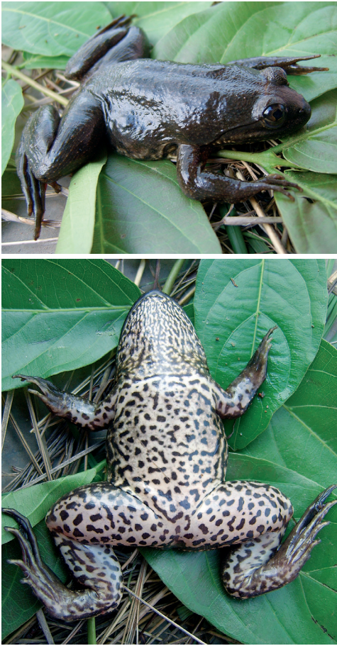
Fig. 5. Dorsal and ventral view of an undetermined Conraua species from the Saala Waterfalls (see Fig. 3).

7) around the Touri Dam. Based on their general distribution area, both species were supposed to occur in Guinea (RÖDEL 2000). Kassina fusca was represented by individuals that were unusually small. Male K. fusca reached 27.5–32.5 mm SVL (N = 5; 31–35 mm according to RÖDEL 2000), while a female measured 30.4 mm SVL (32–37 mm according to RÖDEL 2000; 29–33 mm SVL for both sexes according to SCHIÖTZ 1967).