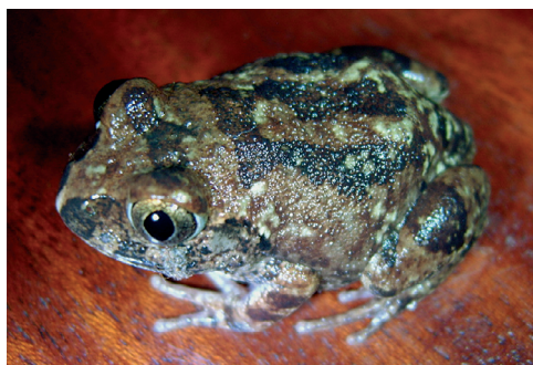
Fig. 7. Leptopelis bufonides is a very patchily distributed savanna frog, occurring from Senegal to northern Cameroon. The record from the Touri Dam is a first Guinean record. This individual shows an unusual pattern with yellowish spots on the back.

River. The area around these rocks was rather open and frequently visited by humans who crossed the river exactly where Conraua sp. occurred. As rainfall was still rare, we were not able to observe if the habitat preference of the frogs changed with a rising water level.