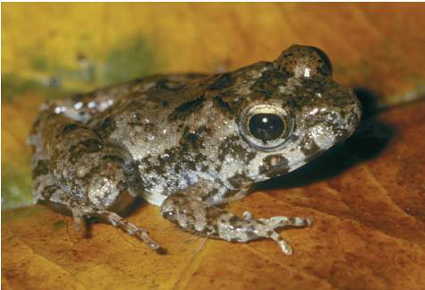
Fig. 4. Phrynobatrachus ghanensis , a species confined to primary swamp forest.

publication. Frogs of this species were caught close to the River Banco and in closed canopy forest at about 1 km from the source of this river in leaf litter. Recorded specimens measured between 30-64 mm SVL.