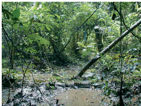
Fig. 2. Swampy part of the Banco National Park (Tarnsect 6).

crosses the entire reserve over approximately 9 km. It has its source close to the northern edge of BNP and flows into the Ebrié lagoon. BNP mainly consists of moist, almost primary forest on predominantly sandy soils.