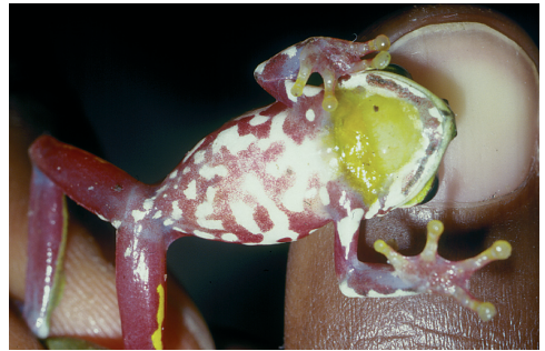
Fig. 5. Hyperolius fusciventris lamtoensis male with female colouration.

parts of the forests and even on dirt roads. Only very open forest parts were not inhabited by this species. After rain, males called also during daytime. The metallic advertisement call was emitted by specimens with and without a black hourglass pattern on the back. Males measured up to 21 mm SVL, females up to 28 mm. The call of the second species sounds similar but is lower in frequency. None of the specimens recorded as species 2 with known calls exhibited a hour-glass pattern on the back. SVL of males was within the range of species 1.