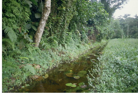
Fig. 7. Forest edge with water filled ditch in the Banco National Park. The right part of the picture shows part of the central clearing with the fish farm. The new hyperoliid species was often encountered in the lower shrub stratum at the forest edge.

Our investigations revealed the occurrence of an undescribed treefrog species, representing a new genus, in BNP. This species was first discovered about 30 years ago by J.-J. MORÈRE (J.-L. PERRET in lit.), but never described scientifically. Males are brown to beige with black spots on the back and a small gular gland (Fig. 6). Females are orange to red and have grayish to bright blue eyes (Fig. 6). The iris of males varied from porcelain white to greyish or yellowish brown. Male's advertisement call was very faint and was not audible from more than 3 m away. A separate paper will deal with the description of this species, its phylogenetic relationships and its natural history. We collected 38 specimens at night on trees and on grass or reed