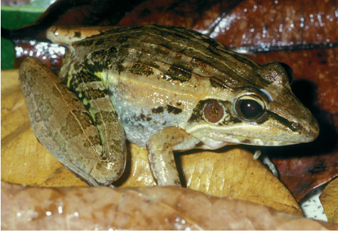
Fig. 3. Ptychadena aff. mascareniensis from the fish farm within Banco National Park.