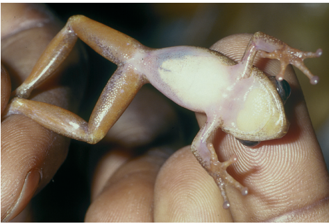
Fig. 6. A new hyperoliid frog from Banco National Park; female (top, photo: D. MAHSBERG) and ventral aspect of male (bottom).

pattern normally typical for females of this subspecies (Fig. 5, compare SCHIØTZ 1967, 1999; RÖDEL 1998).