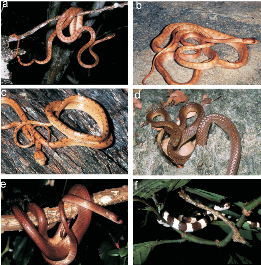
Fig. 2. Colour photos of Stenophis specimens assigned to the subgenera Phisalixella (a-d) and Parastenophis (e-f) / Farbabbildungen von Stenophis -Exemplaren aus den Untergattungen Phisalixella (a-d) und Parastenophis (e-f) sensu DOMERGUE (1995). (a) Stenophis arctifasciatus , Andasibe (ZSM 231/2002). (b) Stenophis variabilis , Kirindy (UADBA). (c) Stenophis inopinae , Montagne des Français (ZSM 551/2000 or 552/2000). (d) specimen from Ankarana (not collected / nicht konserviert; photo B. LOVE) that probably represents / wahrscheinlich Stenophis inopinae . (e) Stenophis betsileanus , “giant” specimen in an Marojejy (ZFMK 60500). (f) Stenophis betsileanus , Masoala Corridor (MRSN R1973).

irregular markings, very similar in this to the state in large S. granuliceps that also lose the crossband pattern. The main difference is a relatively high number of ventrals (257 vs. 245 in the specimen with highest count from Nosy Be). Two further distinctive features discussed by C. DOMERGUE in an unpublished manuscript available to us, and verified by us in the type, are the postgulars which are separated by two pairs of small scales, and the sixth supralabial which is fused with a scale usually located above it. We do not believe that these characters are sufficient to accept capuroni as separate species and therefore consider it as junior synonym of S. granuliceps .