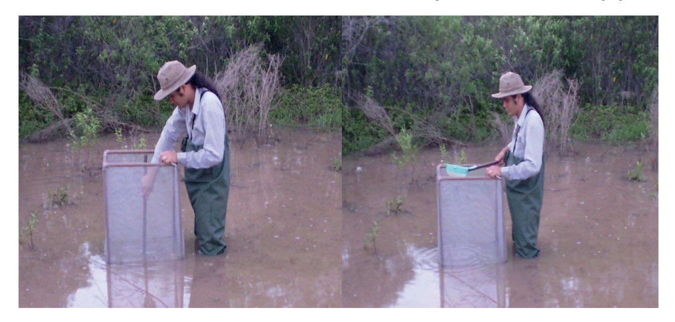
Figure 2. Collection of tadpoles and insect predators using a "throw trap" in the Protected Area Monumento Natural Grota do Angico (MNGA), State of Sergipe, Brazil.

The tadpoles of P. nordestinus have easily distinguishable characteristics and are the only representatives of the family Phyllomedusidae and of the genus Pitechopus in MNGA (GOUVEIA & FARIA 2015). We visually identified these tadpoles by observing the mouth in the anterior position of the head; the dorsal fin originating at the level of the beginning of the posterior third of the body with a curved contour to the end of the tail, which is slightly curved downwards; and the ventral fin with a height of approximately three times that of the dorsal fin, also originating at the level of the beginning of the posterior third of the body, presenting a curved contour (CRUZ 1982). The identification of tadpole predators was based on animals that are commonly reported in other studies (BABBITT & JORDAN 1996, KOPP et al. 2006, MUNIZ et al. 2008, MOGALI et al. 2012), being thus counted as insects belonging to the