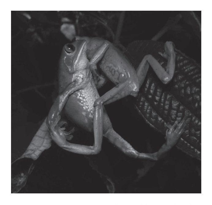
Figure 2. Males of the southern walking leaf-frog ( Phyllomedusa iheringii ) fighting on leaves of the shrub Miconia hiemalis (Melastomataceae) in southern Brazil.

intruder males that frequently chased, intercepted and tried to clasp the attached male. At least twice, we recorded the amplectant males performing leg-stretching behaviour (by stretching and then retracting their hind legs transversally to the body in alternation) while chasing an intruder. In one event, we observed an amplectant male avoiding the approach of an intruder by extending his hind legs straight back and using his feet to immobilise the forelimbs of the competitor male. Males in multi-male amplexi interacted by means of aggressive calls. Intruder males tried to dislodge mating males from the female, and both males fought on the female's back (trying to dislodge each other by kicking with the hind legs) until the intruder male gave up. All the while the female kept moving, with both males on her back.