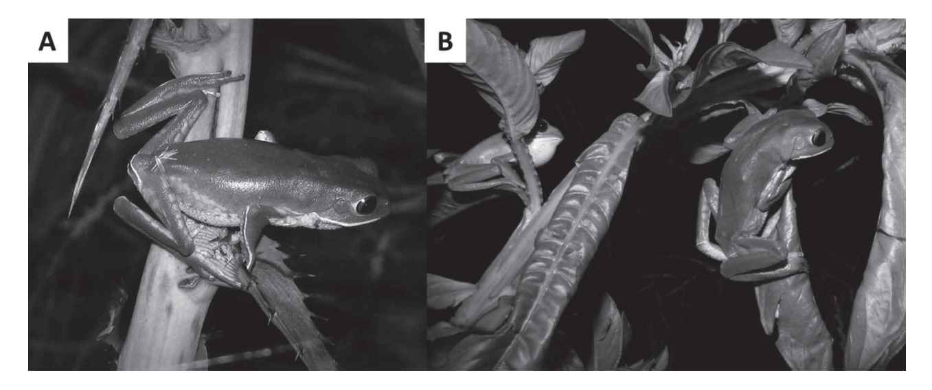
Figure 3. Reproductive sites of the southern walking leaf-frog ( Phyllomedusa iheringii ) in southern Brazil. (A) Male using a bromeliad as a calling site. (B) A female (right) has just finished wrapping her clutch into a leaf, with the male (left) that fertilized the ovules resuming vocalization.

average lengths and widths of the leaves used for oviposition were 10.8\pm4.18 cm (range = 2.3-26 cm, n=497) and 4.20\pm1.55 cm (range = 1-9.5 cm; n=497), respectively. Phyllomedusa iheringii used from one to eight leaves to make a nest (average = 1.55\pm0.96 , n=371). Approximately 4% of all clutches that we sampled were parasitised, always by Diptera larvae (Phoridae and Calliphoridae). In addition, we recorded ant predation on live tadpoles that had hatched and fallen to the ground from nests with no water below. Hatching was likely triggered by rainfall during the previous day and humid weather conditions. Tadpoles fell on the ground and performed irregular spasmodic movements in an attempt to reach a nearby pond. Some succeeded in this quest while others fell victim to ants that were already on the ground.