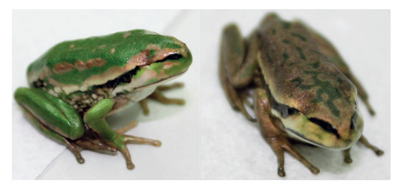
Figure 3. Eyeless Litoria aurea, a few days post metamorphosis.

Background-matching is an essentially anti-predator strategy (STEVENS & MERILAITA 2011). However, in natural conditions, a dark coloration of tadpoles living in shaded areas (dark background) may also improve thermoregulation. Accordingly, some amphibians change their colour in response to temperature (KING et al. 1994, WITHERS 1995, WELLS 2007). While the colour change observed in L. aurea tadpoles was affected by background brightness in laboratory conditions, continuously shaded conditions also induced dark coloration in outdoor tanks. In this later case, an effect of temperature on colour change cannot be ruled out. Similarly, juvenile and adult L. aurea have also been observed to turn dark in shaded habitats (L. PIZZAT-TO pers. obs.).