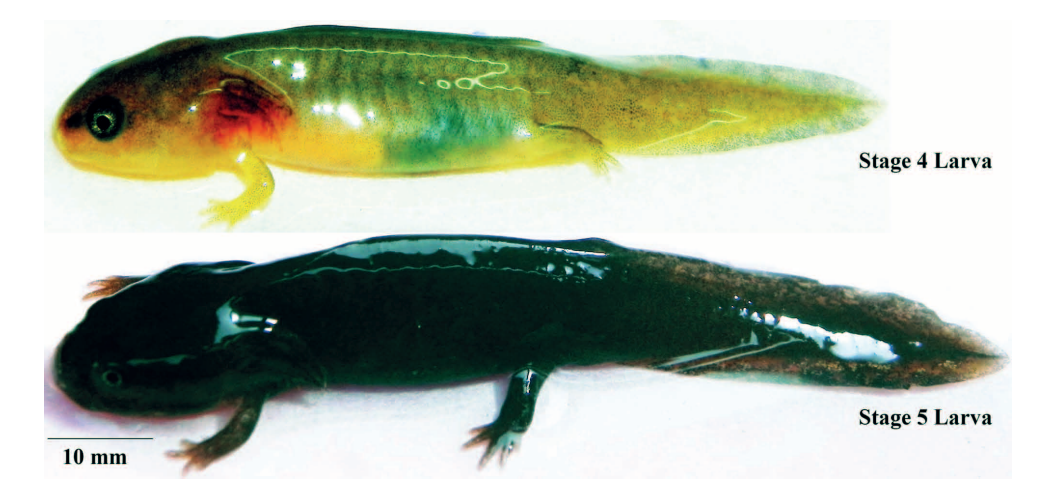
Figure 2. Overwintering larval stages of T. verrucosus in the Darjeeling Hills, West Bengal State, India.

Figure 1. Geographic locations of water bodies surveyed for overwintering larvae of T. verrucosus in West Bengal State, India, distinguished as permanent and temporary ponds, respectively.