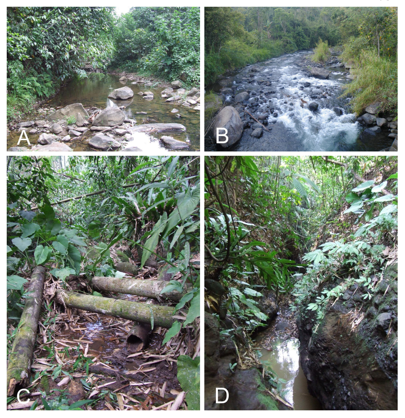
Figure 2. Prospected sites. (A) Site 1, Piglarn stream near Poblacion; (B) and (C) Site 2 within the forest and adjacent Kulaman River, respectively. (D) Site 3 near Culasi.

A complete list of species previously recorded from within the MKRNP and records from the current study per