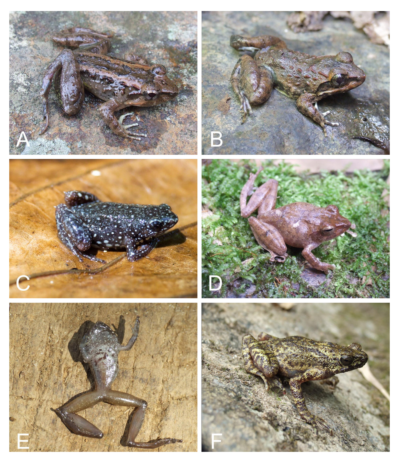
Figure 3. Anurans encountered in the Mt. Kitanglad Range. (A) Limnonectes leytensis ; (B) Limnonectes diuatus ; (C) Chaperina fusca ; (D) Philautus leitensis ; (E) Philautus sp.; (F) Ansonia muelleri .

site can be found in Table 1. In addition to these verified records, a dark Brachymeles sp. was observed at Site 2, but could not be caught for identification. In total, 12 reptileand 10 amphibian species were located of which 15 had not previously been recorded from the MKRNP. A selected number of species representing either geographically or morphologically noteworthy records are discussed below.