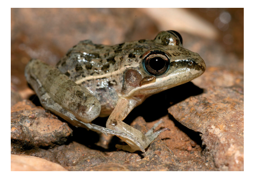
Fig. 1. Adult male (one from MNCN 44065-6) of Ptychadena pumilio in life from Simenti, Niokolo Koba National Park, Senegal.

6861) have been deposited in the amphibian collection and Fonoteca Zoológica, respectively, of the Museo Nacional de Ciencias Naturales, Madrid, Spain (MNCN). Terminology of call characteristics follows HÖDL & GOLLMANN (1986) as modified by PADIAL et al. (2006).